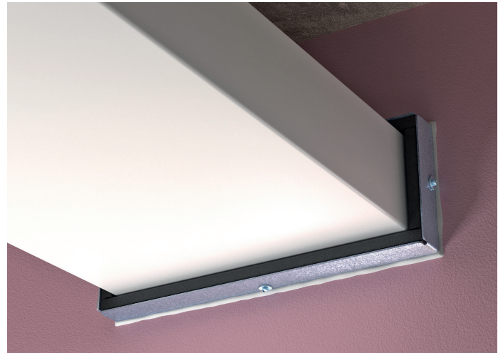
QRS CE Marked Intumescent Fire Sleeve installed in plasterboard partition