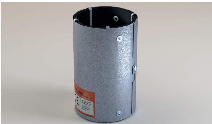
QRS CE Marked Intumescent Fire Sleeve - circular

The QRS Fire Sleeve can also be installed within the QuelStop Fire Batt.