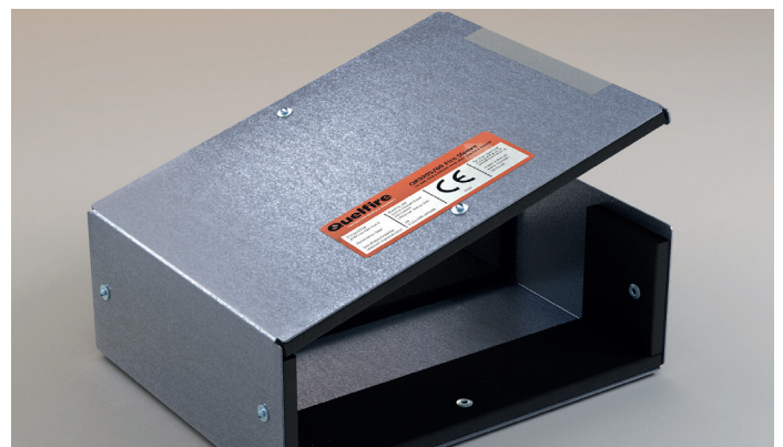
QRS CE Marked Intumescent Fire Sleeve - rectangular (open)

WARRANTY The Company warrants its products to be free from defects in material and workmanship for a period of 12 months from the date of delivery. The Company's obligation under this warranty is limited, as its option, to the repair or replacement, free of charge, or refund of the net Invoiced price of any part found to be defective, and which, in the Company's opinion, has not been subject to undue wear and tear, accident, alteration, abuse or misuse. Consequent damages are expressly disclaimed. Technical advice from Quelfire whether verbal, in writing or by way of trials, is given in good faith but without warranty. The application, use and installation of the Company's products are beyond the control of the Company, and the purchaser is solely responsible that goods are fit for any particular purpose. In line with the Company's policy of continual research and development, product specifications and availability are subject to change or withdrawal without prior notice.