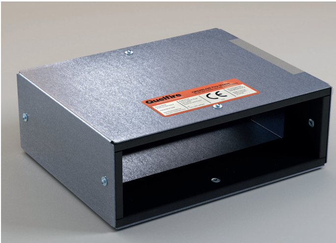
QRS CE Marked Intumescent Fire Sleeve - rectangular

QRS CE Marked Intumescent Fire Sleeves prevent the spread of fire where plastic pipes or plastic ducts penetrate fire compartment walls.