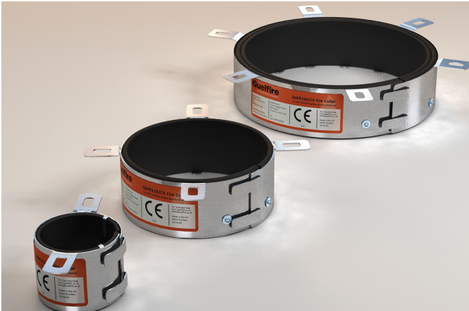
QWR CE Marked Fire Collars

Quelfire QWR CE Marked Fire Collars prevent the spread of fire through PVC, HDPE & PP pipes where they penetrate fire compartment walls and floors.