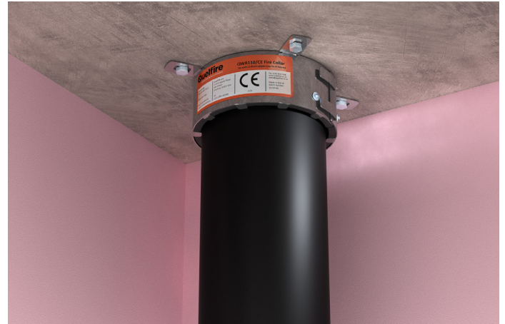
QWR CE Marked Fire Collar installed on concrete floor